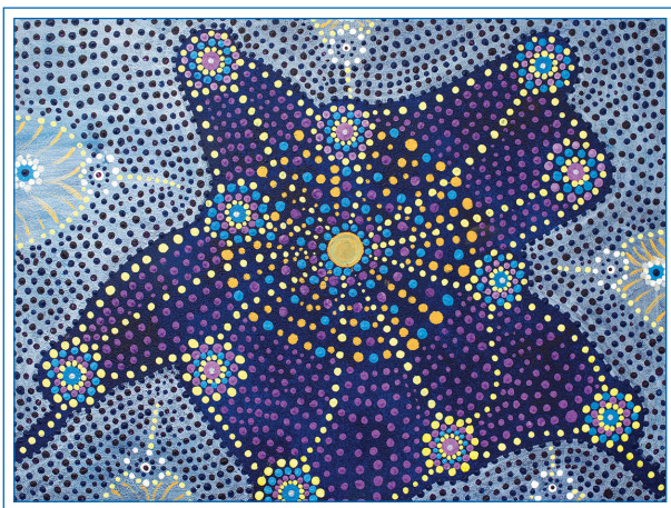
Dalarinji; Ours belonging to us

St Vincent's Hospital Sydney acknowledges Aboriginal and Torres Strait Islander peoples as the Traditional Custodians of the lands and water where we live and work. We respect their spiritual connections to country and community and pay our respects to their Elders past, present and emerging. We commit ourselves to the ongoing journey of Reconciliation.